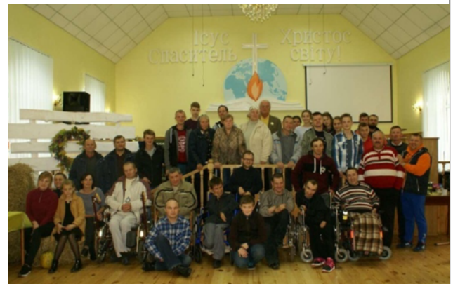
Meeting with special needs people