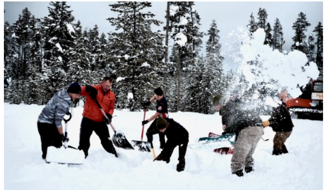
We also helped with a few snow shoveling projects

Our group enjoyed times of fellowship, prayer, and work together as men. This weekend getaway is always refreshing both spiritually and physically.